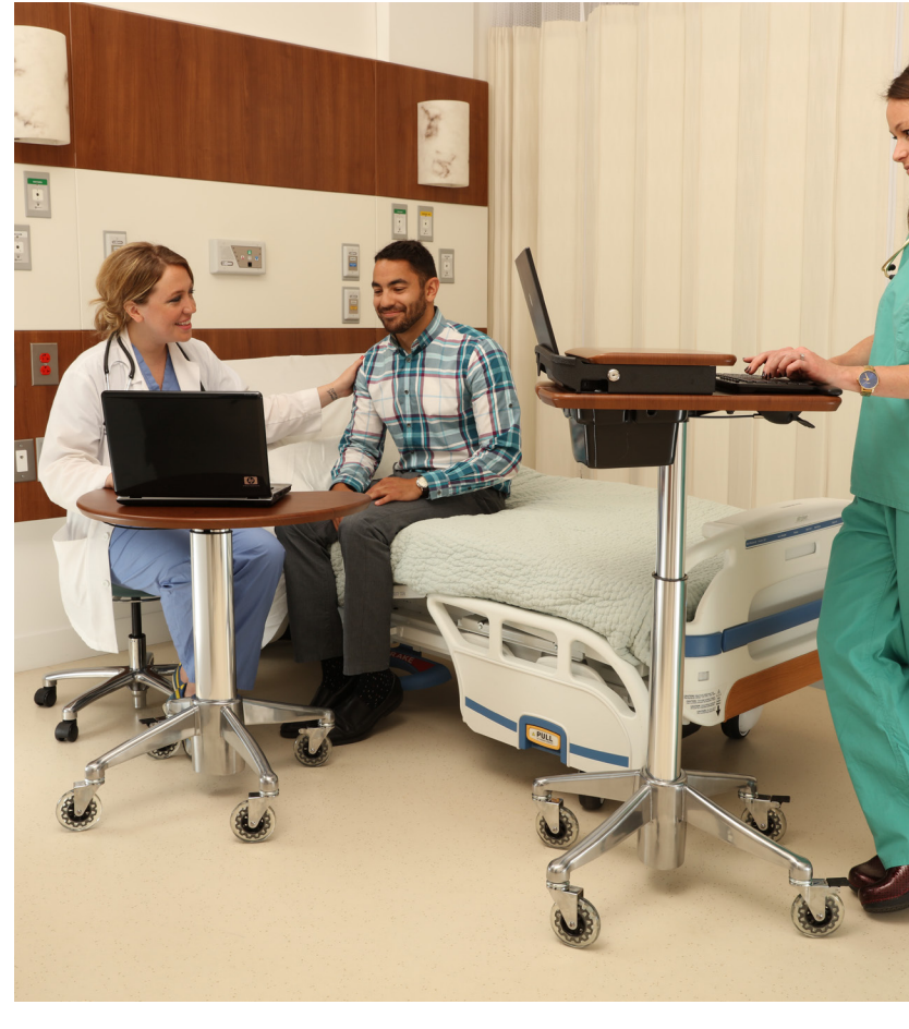
PICTURED ABOVE H Class Laptop Cart – HLC7P2 (Cloud) with Single-Wheel Rollerblade Casters

Increase patient satisfaction with our portfolio of nine nature inspired color options that help reduce stress and promote healing.